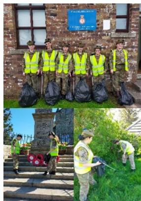
Top; Cadets of Halkirk with their bags full after a day's picking. Bottom Left: Cleaning the war memorial. Bottom Right; Cleaning around Halkirk.

For more information about 1 st Battalion The Highlanders click here